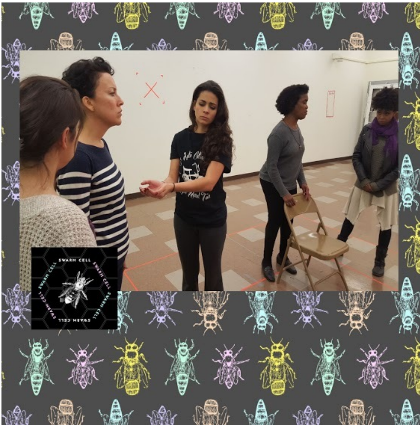
The SWARM CELL cast in rehearsal