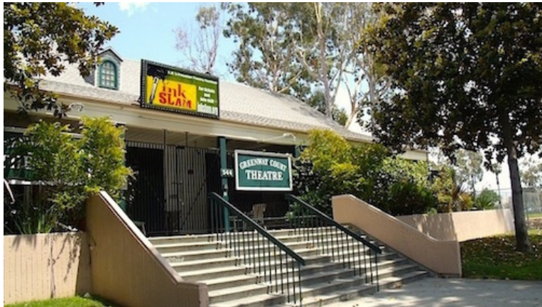
SWARM CELL , with previews Jan. 28-29, opens Jan. 30 at Greenway Court Theatre